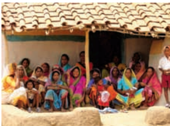
Progress is driven by women's self-help groups

The next generation of DFID support focused on the watershed based development programmes of the Government of India, initially in three states. DFID support transformed these from natural resource programmes focus, emphasising physical conservation works and primarily benefiting larger, mostly male, landowners, to people centred programmes, inclusive of all the residents of the watersheds and paying particular attention to landless, women and other vulnerable groups. This has become known as a 'watershed plus' approach. Specific elements of the 'plus' are components for productivity enhancement and micro-enterprise promotion with earmarked funding, as part of a broader approach that includes enhanced participation, capacity building and innovation.